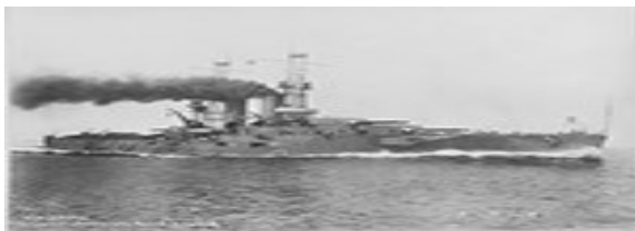
The UTAH at flank speed