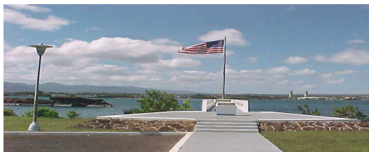
UTAH Memorial Ford Island Pearl Harbor